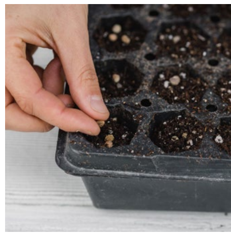
STEP 5 Drop 1 or 2 seeds (unless it's a multi-seeded variety) into each hole until the tray is completely full.