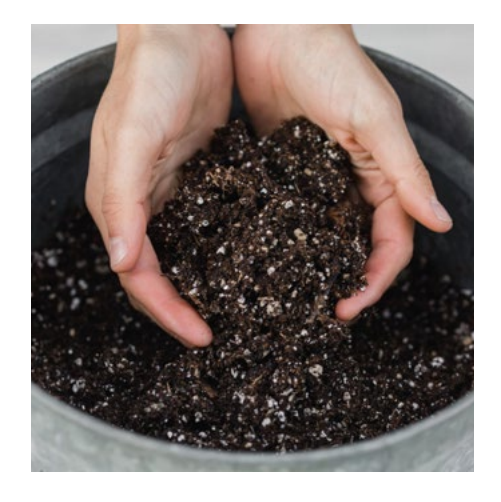
STEP 1 Moisten seed-starting mix until it is thoroughly damp but not dripping wet.