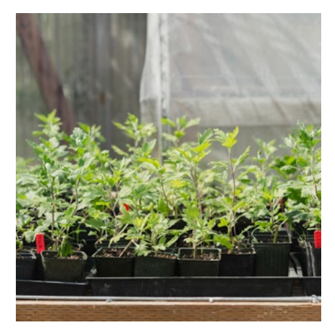
off young plants before putting them out into the garden; otherwise they will be shocked by the sudden change in temperature. To do this, set trays in a sheltered spot outside, increasing the amount of time they are out each day, starting with 2 to 3 hours, then increasing the time outside slowly over the course of a week or two, at which point seedlings can remain outside.