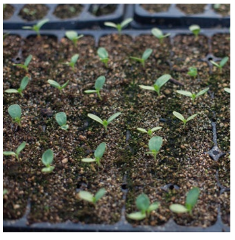
STEP 11 If seedlings begin to outgrow their trays before you're ready to plant them outside, repot them into larger containers. Or, if the weather is warm enough (after all danger of frost has passed), begin transitioning them outside.