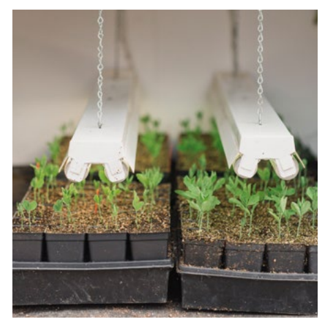
STEP 9 Check the trays or pots daily. Once 50-75% of the seeds have sprouted, remove the acrylic dome lids and move trays to a spot with bright light such as a greenhouse or under lights. Seedlings need 14 to 16 hours of light per day.