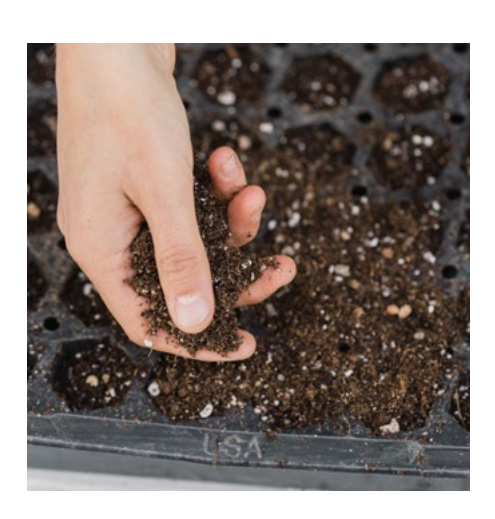
STEP 6 Cover newly sown seeds with a light dusting of fine vermiculture or seed-starting mix. Be careful to not bury the seeds too deeply.