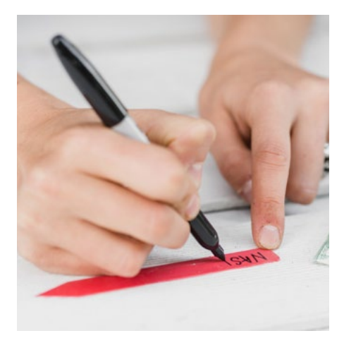
STEP 3 Label the tray or pot with the name of the variety you plan to sow and the date planted.