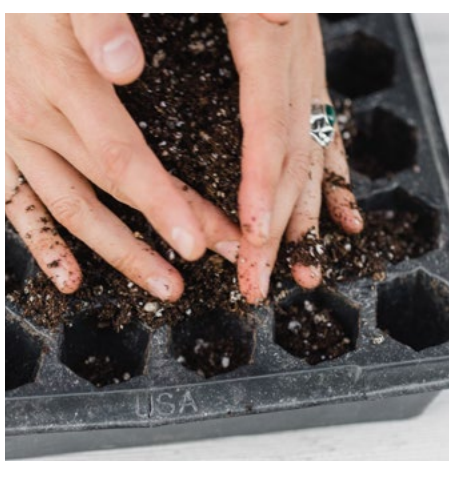
STEP 2 Fill seed trays or pots to the top with soil, tapping them firmly against the table as you go so that the soil settles and there are no air pockets trapped in the cell trays.