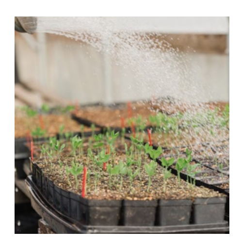
STEP 10 Check seedlings daily and water when the soil appears dry, which could be every day or two.