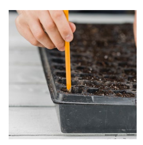
STEP 4 Make a shallow hole in each cell using your finger, a pencil, or a chopstick. A general rule is to plant the seed twice as deep as its longest side.